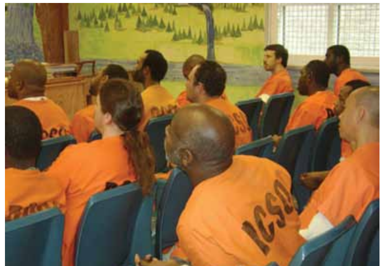
Nashville Inmates hunger for Truth

We consider it a privilege, that our father has considered us to be the ones to take His message of love, freedom, hope, and forgiveness, to those scorned by society. The year “2008” was a great year of opportunity given by God to this ministry. We traveled to over 15 jails, prisons, and youth facilities in Georgia, Florida, Louisiana, and Tennessee.