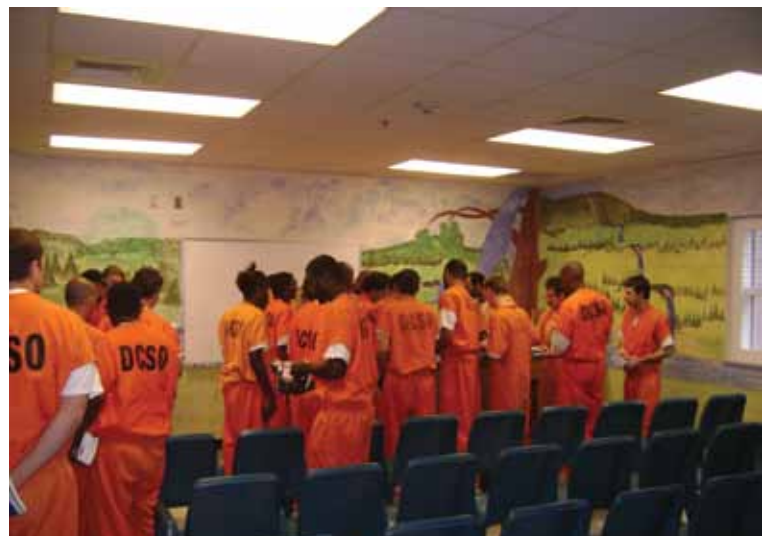
CDC Inmates Respond to Doctrine

He allows things to happen sometime to prove our faith and cause us to depend on Him. We are challenged in trials to concentrate on who God is and His plan for our lives. It is sad that many do not know God or His plan for their lives