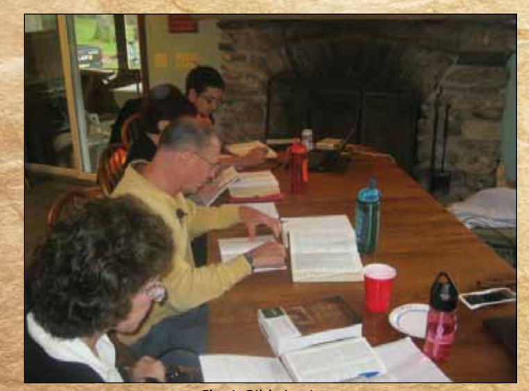
Charis Bible Institute

Grace Prison Ministries partnering with Bible Training Centre for Pastors formed Charis Bible Institute in June 2011 which seeks to extend non-formal theological training free of charge by forming Bible institutes in prisons for those growing to maturity in Christ and have expressed interest in getting training for local church ministry and missionary work aboard. The best pastor, evangelist, and teacher is one who came from that culture and properly trained. We are now extending our service to churches.