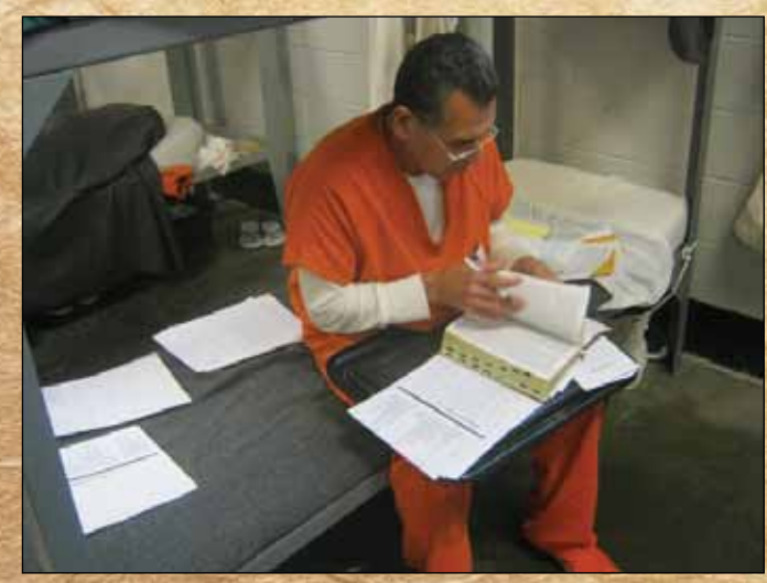
Discipleship by mail

The Discipleship through Mail outreach is designed to equip new believers in the basic fundamental doctrines for living the normal Christian life. Bible lessons and resources are mailed to individual students in various prisons, jails, and youth detention centers, providing them an opportunity to learn and grow at their own pace. These lessons are reviewed and then mailed back to the students with comments that will provide a greater understanding of Bible truths. There are nearly 500 students enlisted in this program nationwide. D.T.M. is also designed to help develop the serious students who have already completed the basics, by creating personalized studies and providing more biblical resources to help them continue their growth to maturity. Upon completion of the basics, students are rewarded with a study Bible, which is hard for some to get in prison.