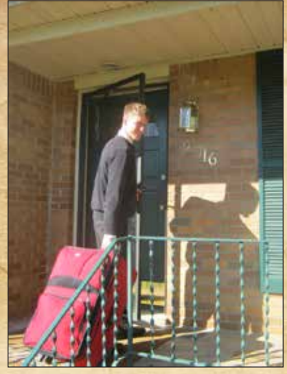
Operation Impact Lives

In an effort to assist recently released inmates, GPM offers temporary housing, food, clothing, and limited transportation. By God's grace, GPM has a 2400 square ft. house on 1 acre of land in Madison, TN. This facility is temporal housing for those recently released inmates that have been proved and are positive towards learning and