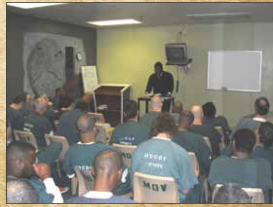
Grace Prison Ministries

Financial Policy: Grace Prison Ministries is a Christian non-denominational, mission minded, and Bible teaching non-profit tax-exempt organization under the Internal Revenue Code 501 (c) (3). All contributions to this grace ministry are tax deductible. G.P.M. offers its services free of charge. We trust God to meet the needs of this ministry. We do not solicit funds but operate entirely on voluntary contributions. When under-standing the need to reach lost souls with the good news and sound Bible teaching motivate you to contribute, you have the privilege of giving and sharing in the dissemination of the Word of God. This is a grace ministry.