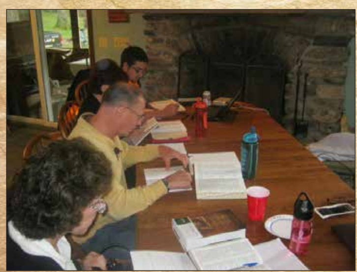
Charis Bible Institute

Grace Prison Ministries partnering with Bible Training Centre for Pastors formed Charis Bible Institute in June 2011 which seeks to extend non-formal theological training free of charge by forming Bible institutes in prisons for those growing to maturity in Christ and have expressed interest in getting training for local church ministry and missionary work aboard. The best pastor, evangelist, and teacher is one who came from that culture and properly trained. We are now extending our service to churches.